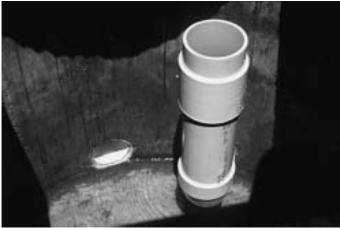
Figure 2. Water Level Control Box

Remove the inspection cap at the inlet distribution pipe to check for solids. Make sure the water is nearly clear with no or very few suspended solids. If solids are observed, check the septic tank and effluent filter for malfunction or problems and take corrective action. These solids can easily overload the treatment cell and cause failure. Note that some black solids attached to the inside of the pipe are common and may be knocked loose as the inspection cap is removed.