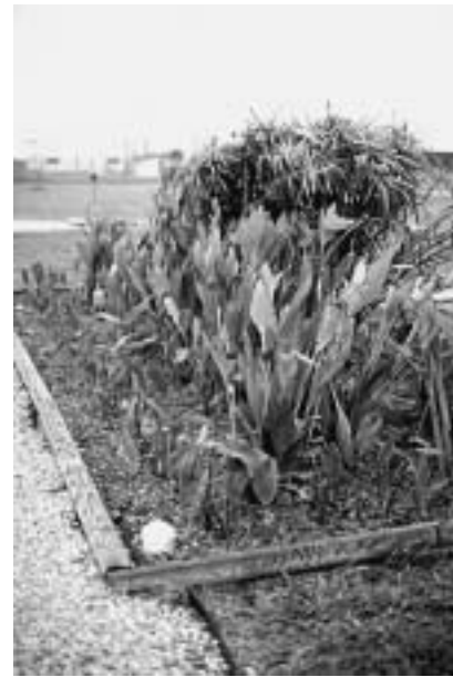
Figure 4. Lined Treatment Cell with Ornamental Plants