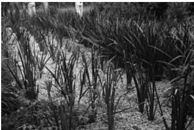
Figure 3. Lined Treatment Cell with Sweet Flag and Iris

If problems are apparent, a contractor should be called to help troubleshoot and take steps to avoid recurrence. In some soil conditions, an overflow basin (assuming space permits) may be needed to receive and store excess flows so runoff from the site does not occur. If the system includes an overflow basin, methods to keep people and animals away from the area during overflow periods should be prepared. Permanent or temporary fencing are options and vegetation surrounding the cell may be helpful.