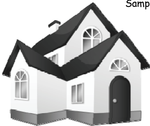
Sample of Drawing: